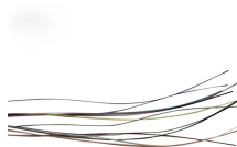
Figure 8. Typical intensity profile of the individual emitters (fast axis collimation plus slow axis imaging) within a soldered laser bar (left) and a clamped laser bar (right).

As these laser diodes generate large amount of heat fluxes that can adversely affect their performances and reliability, a thermally-effective packaging solution is required to remove the excessive heat ...